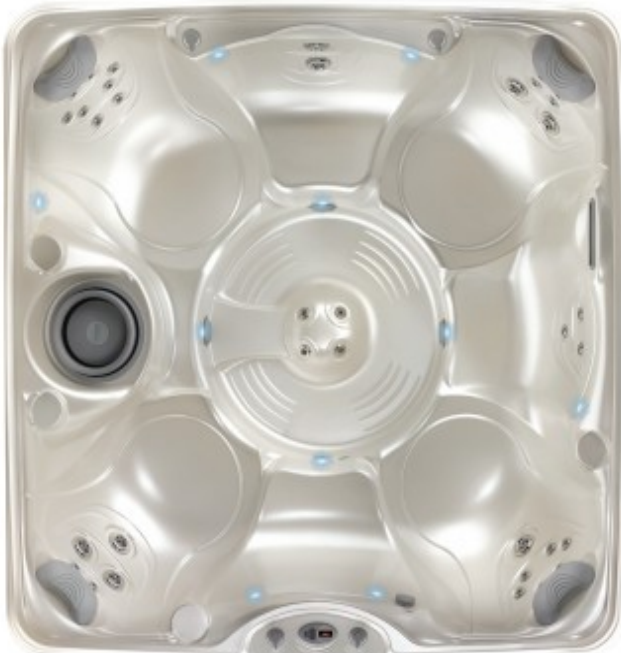
Shown with Pearl shell